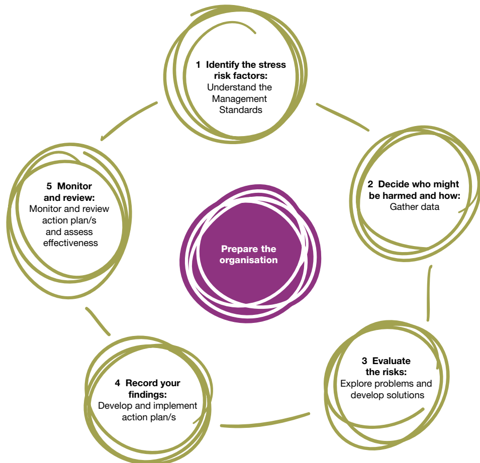
Figure 1 The Management Standards approach

The approach is aimed at the organisation rather than individuals, so that a larger number of employees can benefit from any actions taken.